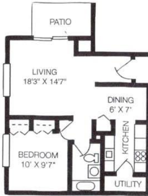
ONE BEDROOM 770 square feet