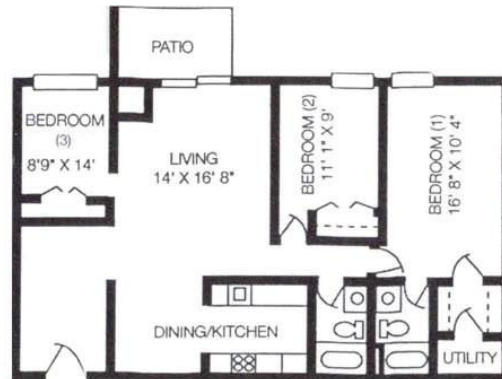
THREE BEDROOM 1,070 square feet