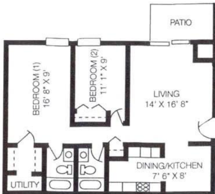
TWO BEDROOM 940 - 1,000 square feet