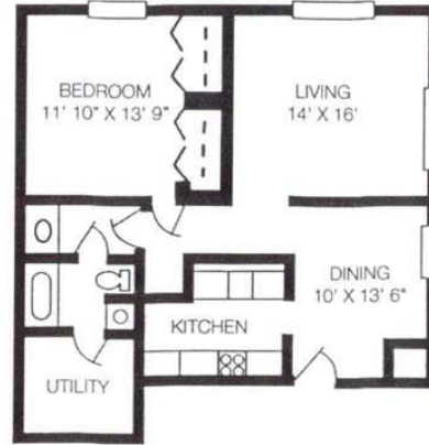
ONE BEDROOM DELUXE 950 square feet