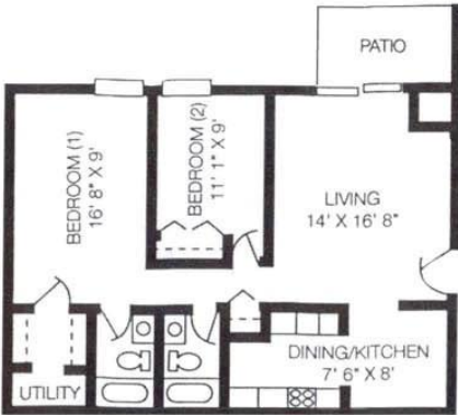
TWO BEDROOM 940 - 1,000 square feet