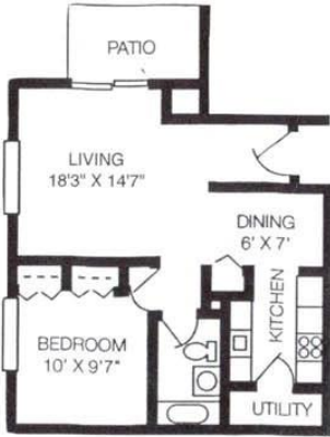
ONE BEDROOM 770 square feet