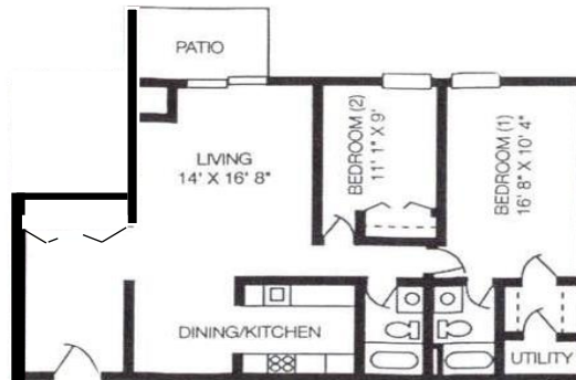
TWO BEDROOM with Foyer 1,000 square feet