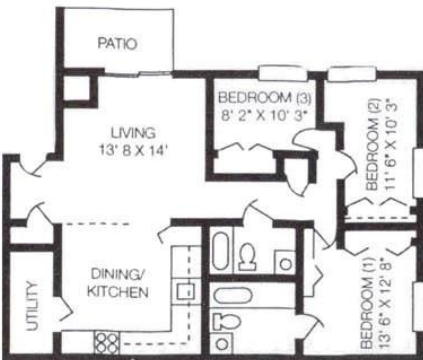
THREE BEDROOM DELUXE 1,100 square feet